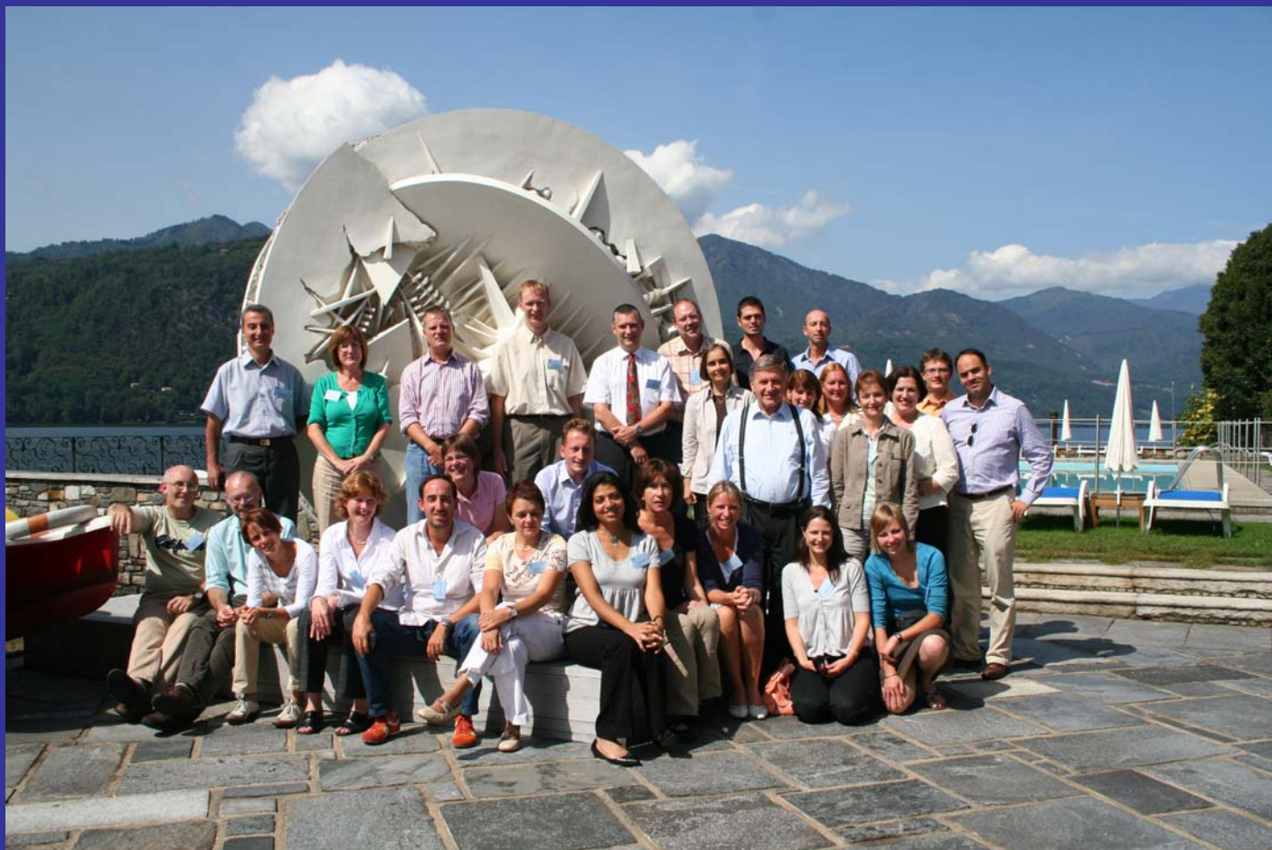
The delegates and teachers of the second international summer school on care pathways.